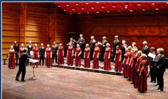
The winner of Grieg Grand Prix 2009: SOFIA VOKALENSEMBLE, Sweden